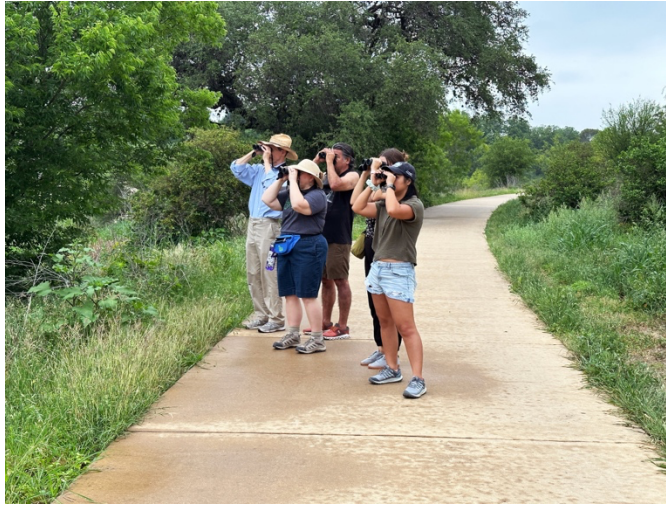
Community members in San Antonio, TX on an Artist-Led Bird Walk as part of Mark Menjivar's La Misma Canción (The Same Song), 2024.

2024. The project explores birds to discuss migration and the interconnectedness of the Americas. An optional artist-led bird sit at the Harlem Meer will begin directly following the walk.